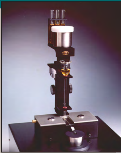
The heart of the T 2 FM is the thistle tube and the magnet